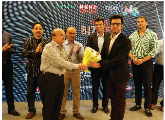
Felicitation of TDO officers for their Hardwork in Month of December 2021