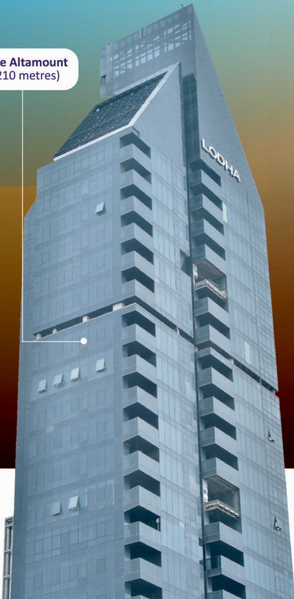
One Altamount (210 metres)