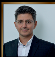
Mr. Boman Irani Rustomjee Group