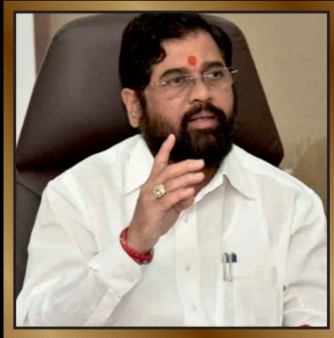
SHRI. EKNATH SHINDE

Cabinet Minister UD & PWD Maharashtra, Guardian Minister - Thane