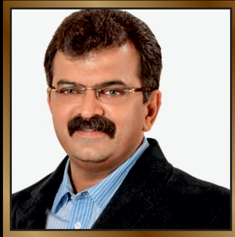
DR. JITENDRA AWHAD

Hon. Minister for Housing Department, Maharashtra